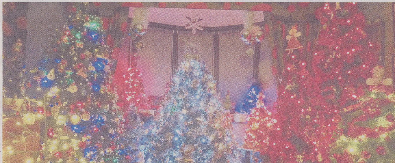
Geoff's Christmas trees