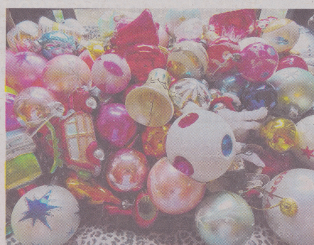
Collection of baubles